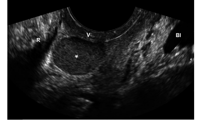
FIGURE 1 Transvaginal ultrasound. Regular hypoechoic nodule affecting the upper part of the recto-vaginal septum. Abbreviations: BI, bladder; R, rectum; V, posterior vaginal wall.

Recto-sigmoid involvement by endometriosis was considered if the muscularis propria layer was infiltrated by solid irregular spiculated hypoechoic nodule involvement, described as "Indian head dress", with or without peripheral vascular Doppler<sup>14</sup> (Fig. S2). Finally, the transducer was positioned in the anterior vaginal fornix to visualize the eventual involvement of the bladder in longitudinal and transverse sections. In order to do this, a moderate repletion of bladder was necessary. The DIE implant could be represented as a hypoechoic or isoechoic nodule in the bladder wall, or as a nodule with a heterogeneous echostructure containing numerous anechoic ("bubble-like") areas<sup>15</sup> (Fig. S3).